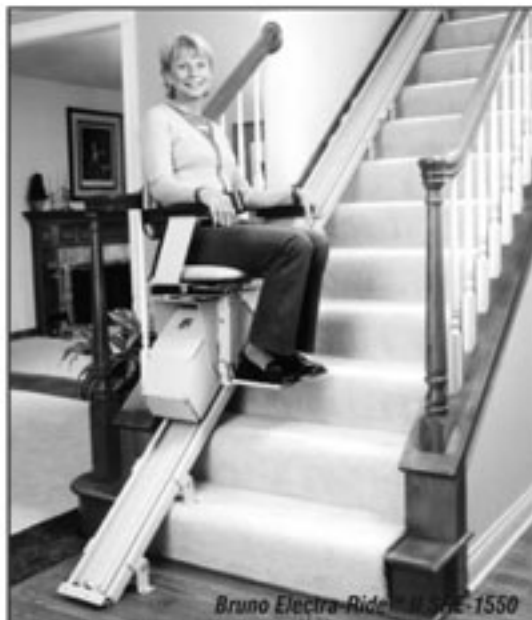
Bruno Electra-Ride Model 1550

"Dedicated to Elevating the Quality of Life through Increased Mobility"