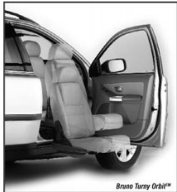
Bruno Turny Orbit™